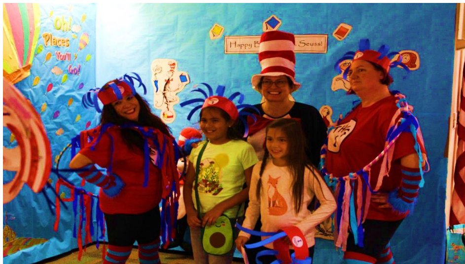
Annual Dr. Seuss Readers Theatre

*Potential Events: Tea-Rexiquette in June Tween Event on June 26